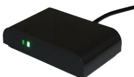
TCM3: HID or Mifare card reader