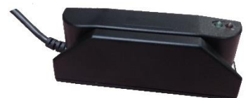
TCMAG1-USB: magnetic card reader