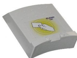
TCM2: HID and Mifare card reader