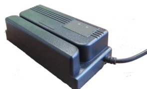
TCBK01: Barcode card reader